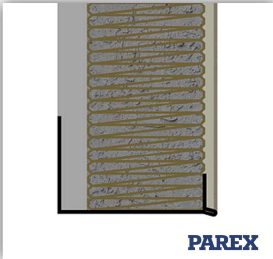
Parextherm Acrylic System 6mm Base Rail

This detail is for general guidance only and is not project specific. Always refer to the project architect details and the PAREX project specific specification.