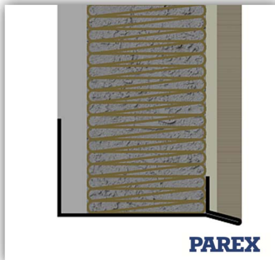
Parextherm Mineral System 15mm Base Rail

System: PAREX THERM onto Steel Frame Application: PAREX THERM system onto Resistant Multi-Rend render board – Base profile Drawing No: PTSNC0511D (In addition to this detail please also refer to detail – PTSNC0511C) Date: June 2016