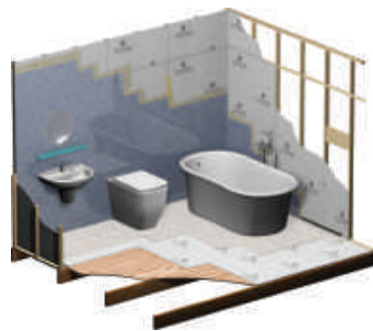
Large Sheet Tile Backer