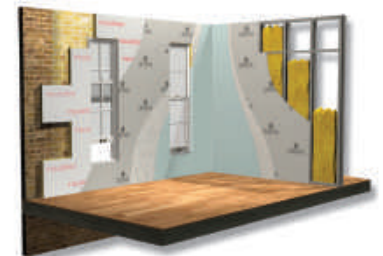
Fire Rated Solid Wall Linings, Stud Partitions & Loaded Floor/Ceilings