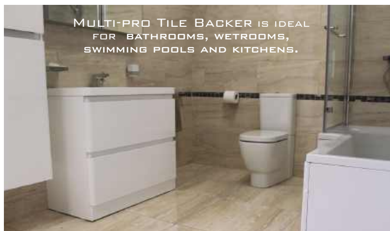
MULTI-PRO TILE BACKER IS IDEAL FOR BATHROOMS, WETROOMS, SWIMMING POOLS AND KITCHENS.

Some rival tile backers contain up to 50% crystalline silica, while Multi-pro Tile Backer contains less than 0.5%, making it one of the safest boards on the market today.